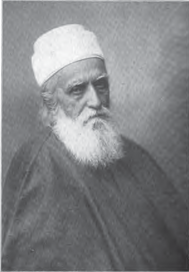
THE CENTER OF THE COVENANT THE GREATEST BRANCH ABDUL-BAHA ABBAS

حِينَئِذٍ تَكُونُ الْوَسْطَةَ الْمَعْنَوِيَّةَ وَتَكُونُ الْمَرْكَزَ الْعَظِيمَ فِي كَوْنِ الْعَالَمِ كُلِّهِ وَتَكُونُ الْمَرْكَزَ الْعَظِيمَ فِي كَوْنِ الْعَالَمِ كُلِّهِ وَتَكُونُ الْمَرْكَزَ الْعَظِيمَ فِي كَوْنِ الْعَالَمِ كُلِّهِ وَتَكُونُ الْمَرْكَزَ الْعَظِيمَ